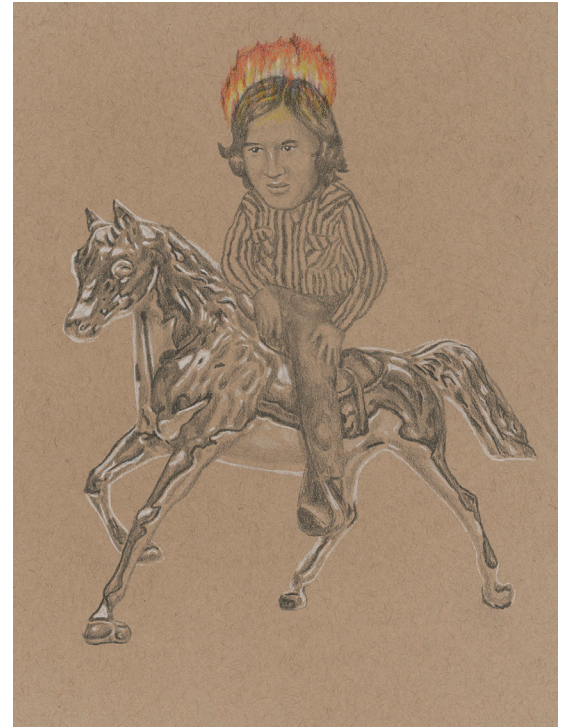
Horse Breaker , Graphite and color pencil on toned paper, 9" x 12", 2019

Bottle Rockets , Graphite and colored pencil on toned paper, 9" x 12", 2019