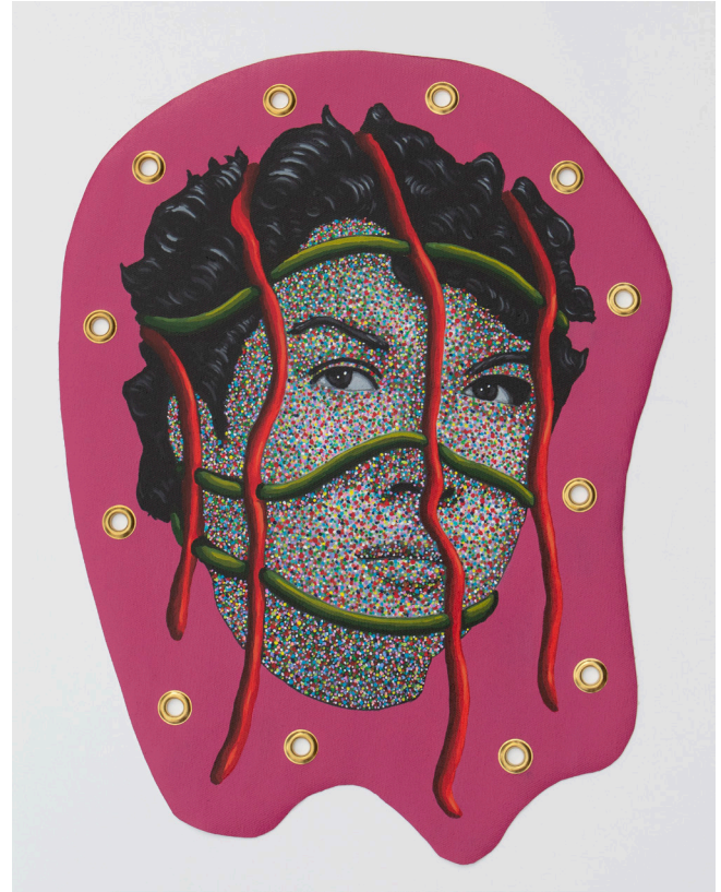
Tino , Acrylic on canvas with grommets, 20" x 28", 2020

Color, Faces, People is a body of work pulling from the language of painting and personal narrative. I am interested in color, light and pattern to create a spectrum of potentialities that reflect a Mexican-American aesthetic centered on my lived experience. I reconfigure family photographs and oral histories into heavily saturated and adorned paintings with free associations and indefinite resolution.