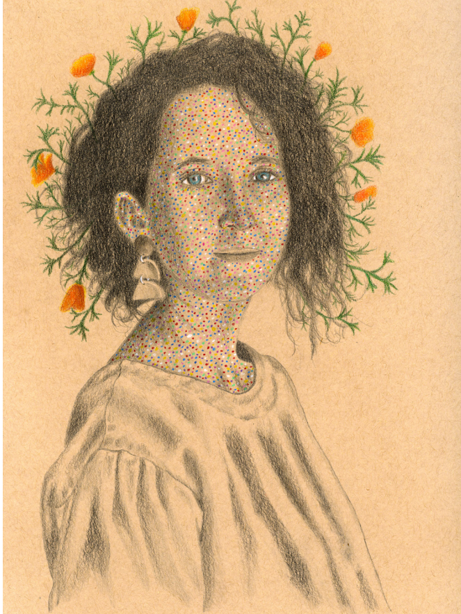
Star , Graphite and color pencil on toned paper, 9" x 12", 2020