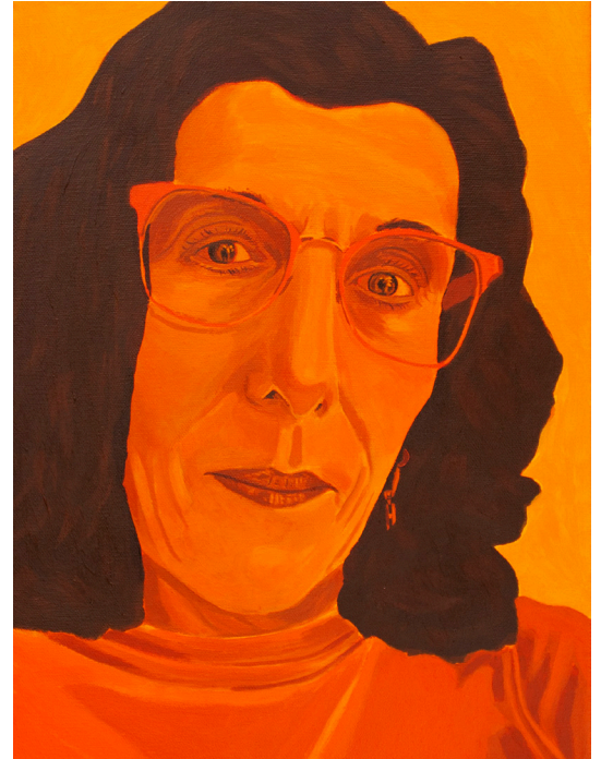
(Spectrum Series) , Painter's Painter , Acrylic on canvas, 12" x 16", 2022