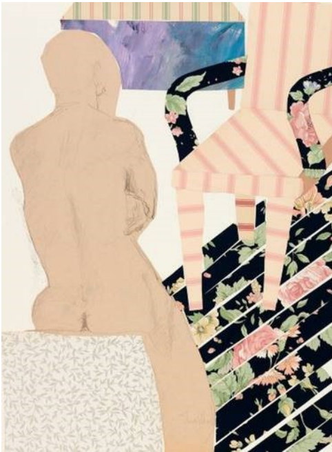
Conversation 2, Living Room Series, mixed media, 18 x 24.

In sculptural work, I use clay to build the house forms. I explore the complexity of feelings and emotions we have towards our homes. One's home contains a vast landscape of emotions. I create forms easily recognizable as houses, like the ones a child would draw, a peaked roof and four vertical walls. Viewer instantly knows my work is about sense of