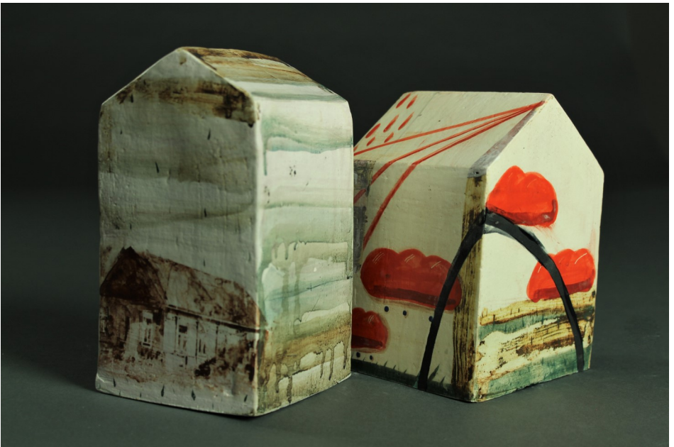
Left: Krasina St. 6 , Ceramics

Untitled, Soda Fire, Clay and wood , 14"x8"x6"