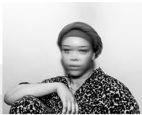
SPINS V, Inkjet Print, 2020, 20 x 20