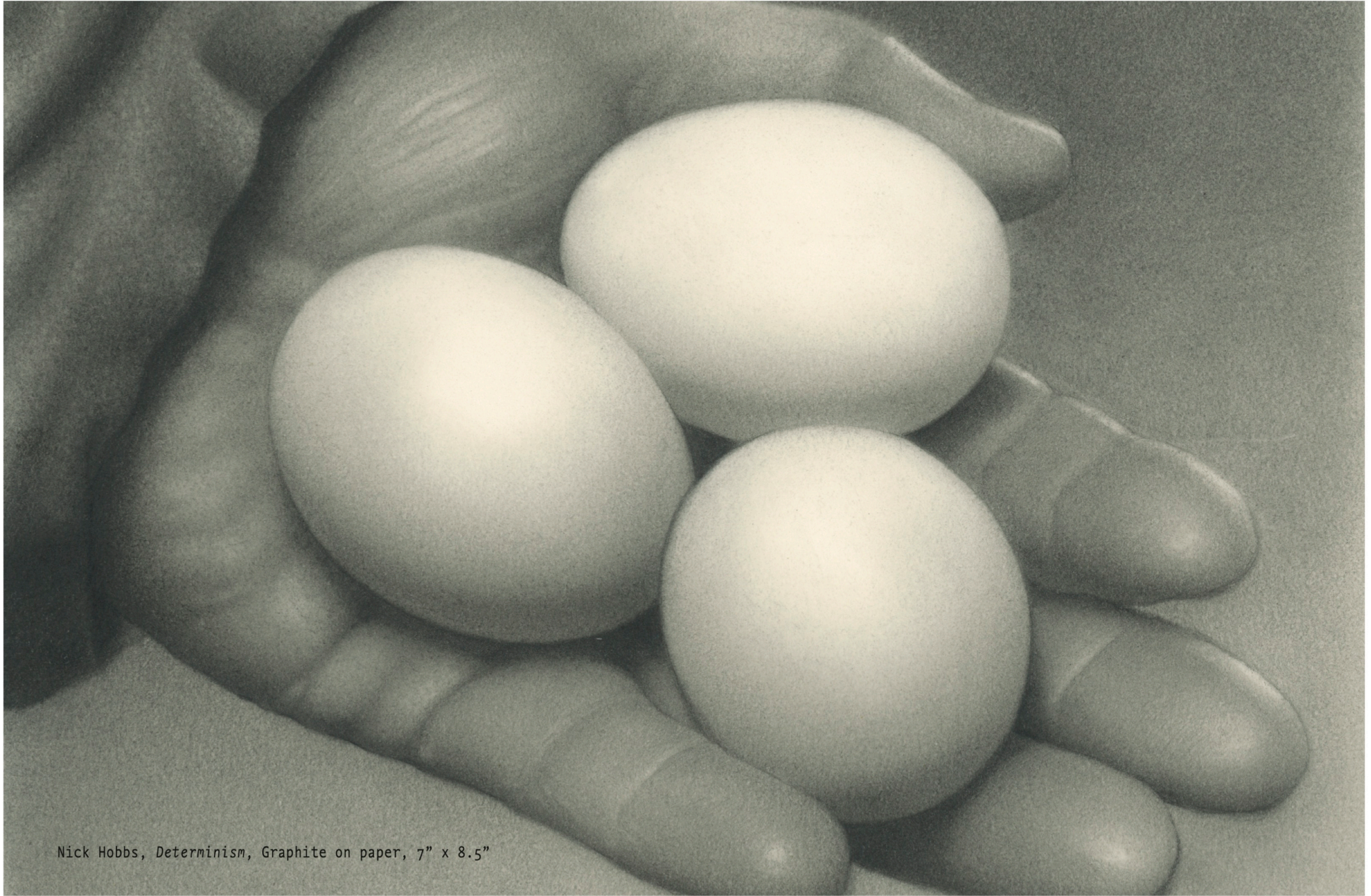
Nick Hobbs, Determinism , Graphite on paper, 7" x 8.5"