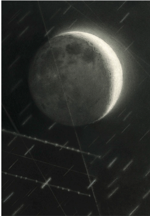
Nick Hobbs, Earthshine , Graphite on paper, 10.25" x 8"