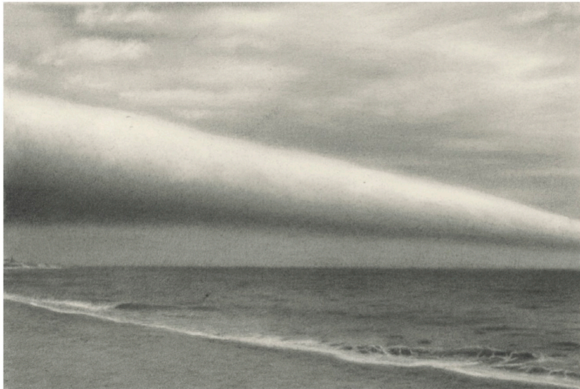
Nick Hobbs, East / West, Graphite on paper, 5" x 7"