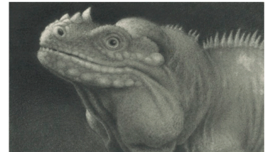
Nick Hobbs, Cretaceous , Graphite on paper, 3" x 4.5"